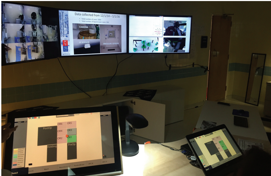
An example of the CORNET artificial intelligent (AI) system collecting data from operating rooms.

Optimizing management of multiple hospital operating rooms (ORs) is an extremely complex proposition. In every hospital, but especially in a large hospital like Houston Methodist that has more than 70 active ORs, staff must schedule and coordinate an enormous number of different procedures per day in each OR. Complicating the situation is the fact that because patients can differ so much, even common procedures can require significant variations in amounts of time required for the procedure.